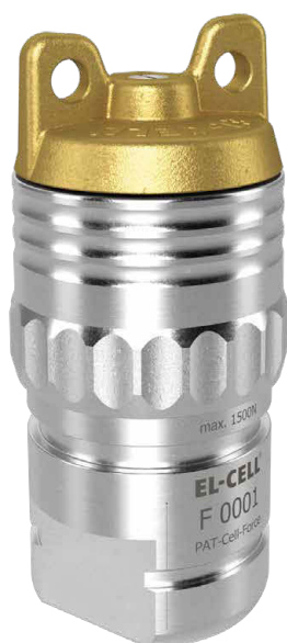
Dimensions in mm: