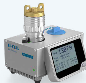
PAT-Cell-Force connected to a PAT-Terminal-1 to adjust initial stack force. The PAT-Terminal-1 can also be used for cycling, if connected to a PAT-Controller-8.