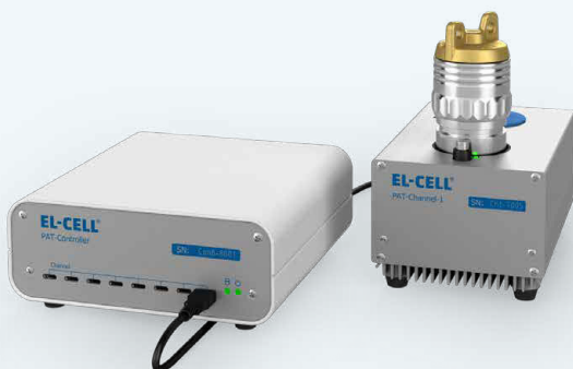
PAT-Cell-Force connected to a PAT-Tester-x-8 potentiostat for cycling.