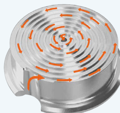
Gas flow along the surface of the lower plunger

The PAT-Core setup using a lower plunger with flow field provides almost perfect plug-flow of the purge gas being essential for quantitative time-resolved analysis. Gases evolved or consumed at the working electrode may be analysed through the composition change of the gas stream that is to be passed along the spiral-type flow field below the working electrode.