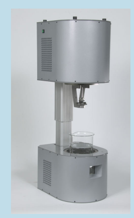
Composite material tested in a solvent bath.